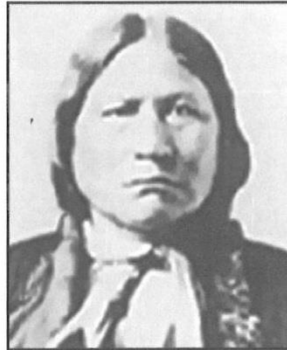
CHIEF BLACK COAL (Arapaho)